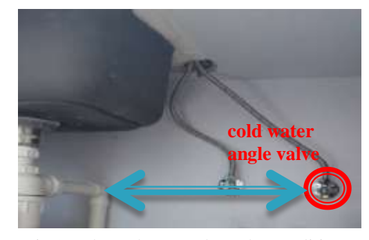
Fig.3 - Photo that can show the conditions of the cold water angle valve and the distance between the angle valve and the fixed settings of its surroundings (like water pipe, gas pipe etc.), to see if they will affect the installation work.

Step 2: Send all the above mentioned photos and the photo of Receipt of buying 3M Water Filters from AAHL authorized retailers, along with your contact details and service address to (852) 9275 8082 via WhatsApp