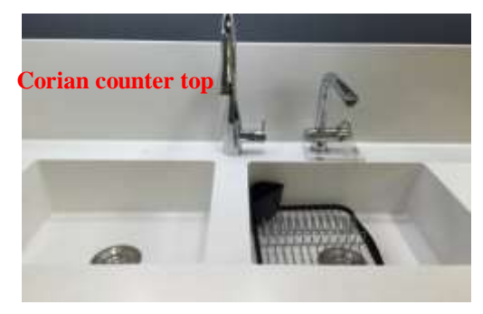
Fig.1- Photo that can show the sink/counter top material clearly.

Step 1: Please use the following fig. 1 - fig.3 as reference to take photos on the planned position/environment for installing the water filter